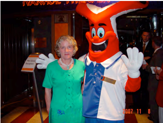
Hey Mom, thanks for the college education.