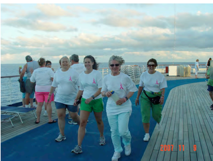
We only have two days to get rid of all that mar-velous food, fabulous desserts, wine, and . . .