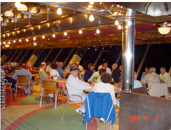
An impromptu, late-night and probably illegal Massey champagne party on the Lido deck.