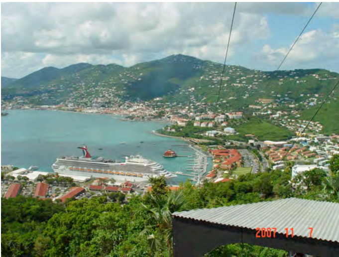
St. Thomas, US Virgin Islands with our ship Valor