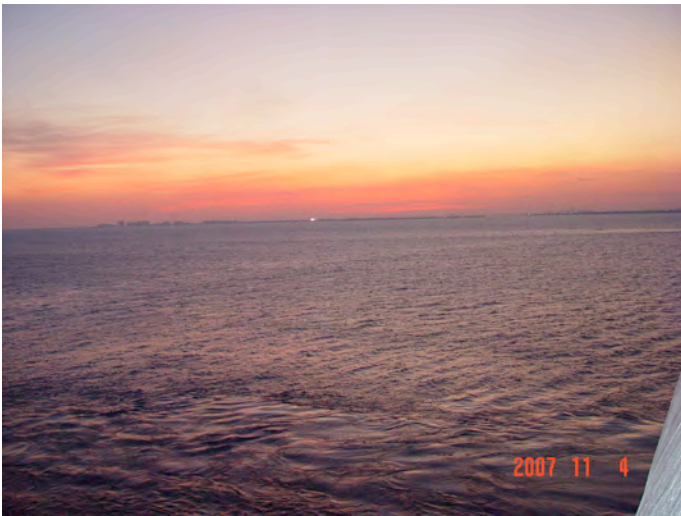
Sunset at sea.