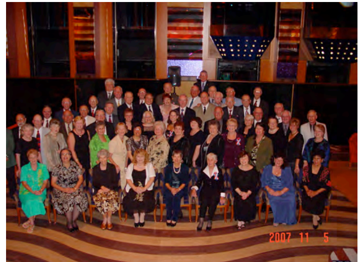
The 2007 Cruise Reunion Attendees: L. to R. --yeah right!!