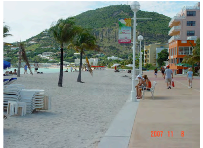
St. Maarten, N.A.