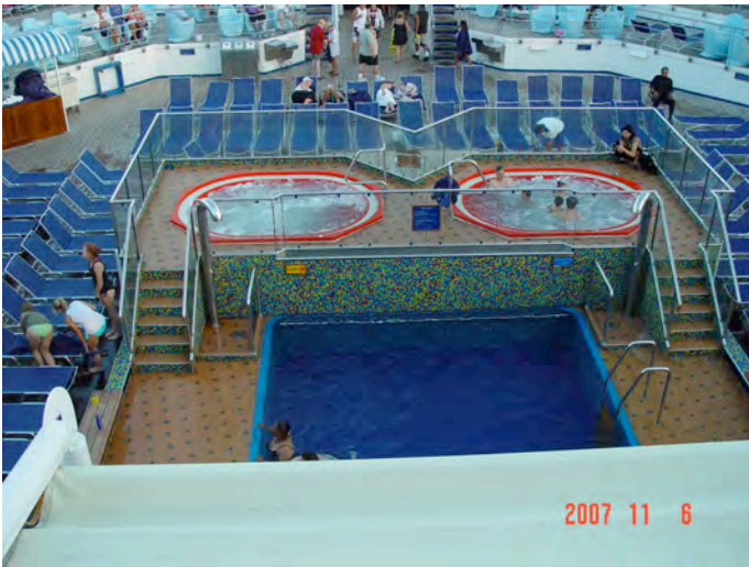
Anyone for a swim or the hot tub?