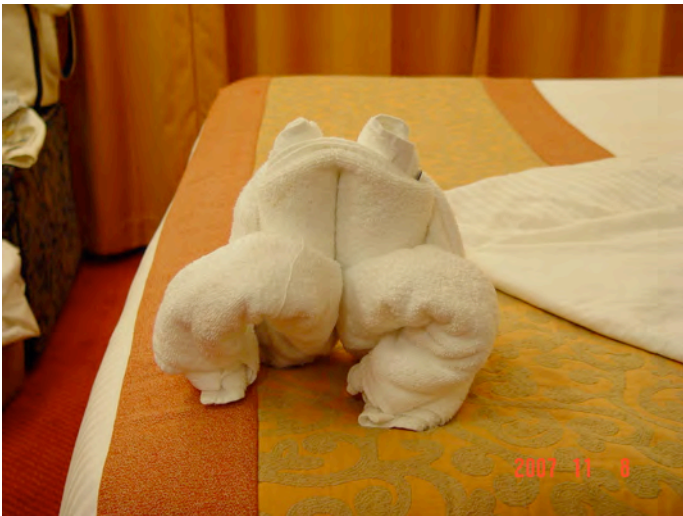
Strange, nocturnal caribbean aquatic animals.