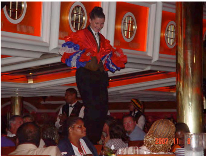
The dining room staff entertained us each night during dinner.