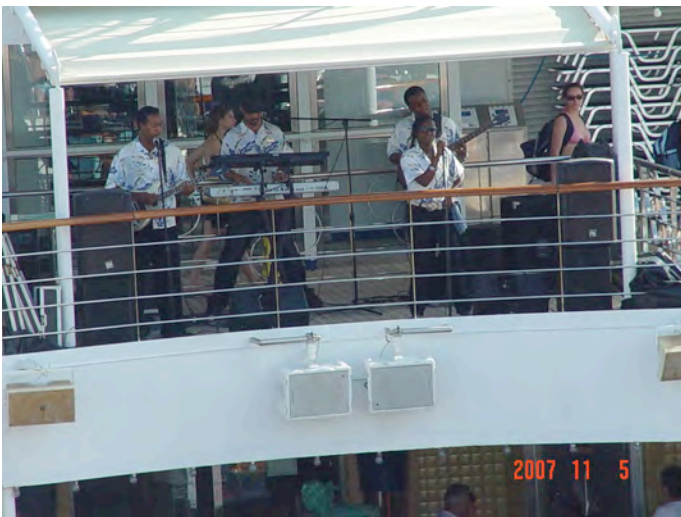
How about some calypso music?