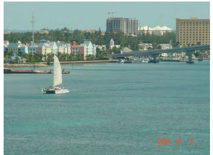
Nassau, Bahama Islands