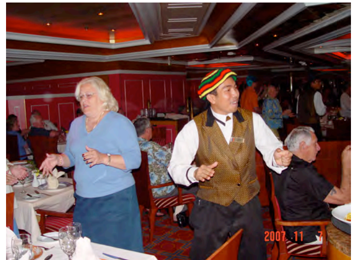
Then, again, some times we entertained them!!